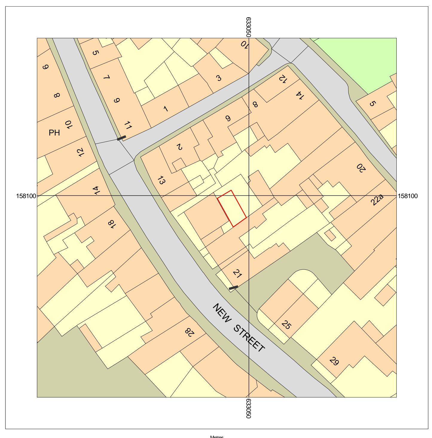
Figure 1 Area watched (red)