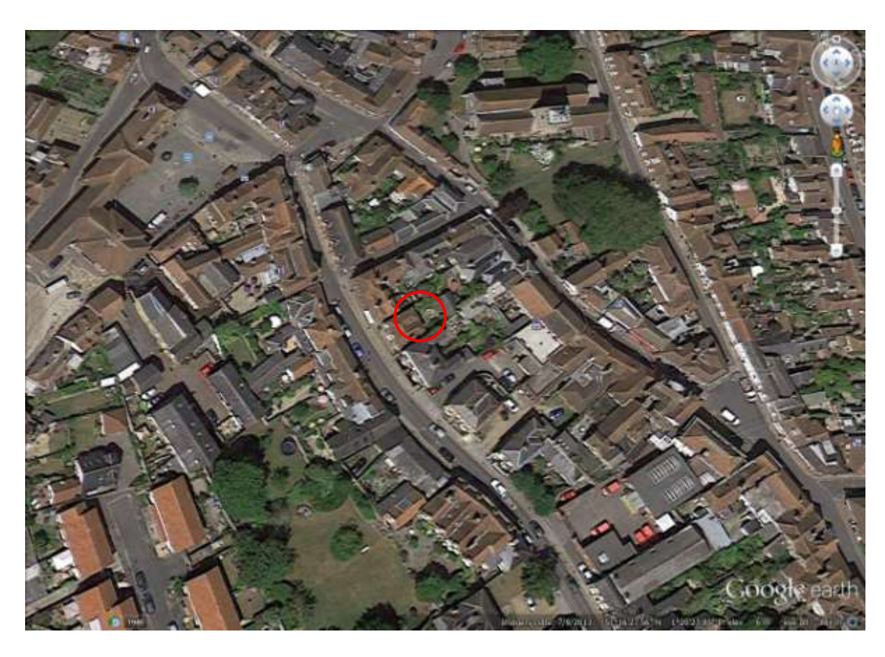
Plate 1. Aerial view of site (red circle) showing the site prior to development.

Date of report: 23/03/2016. Revised 23/06/2016