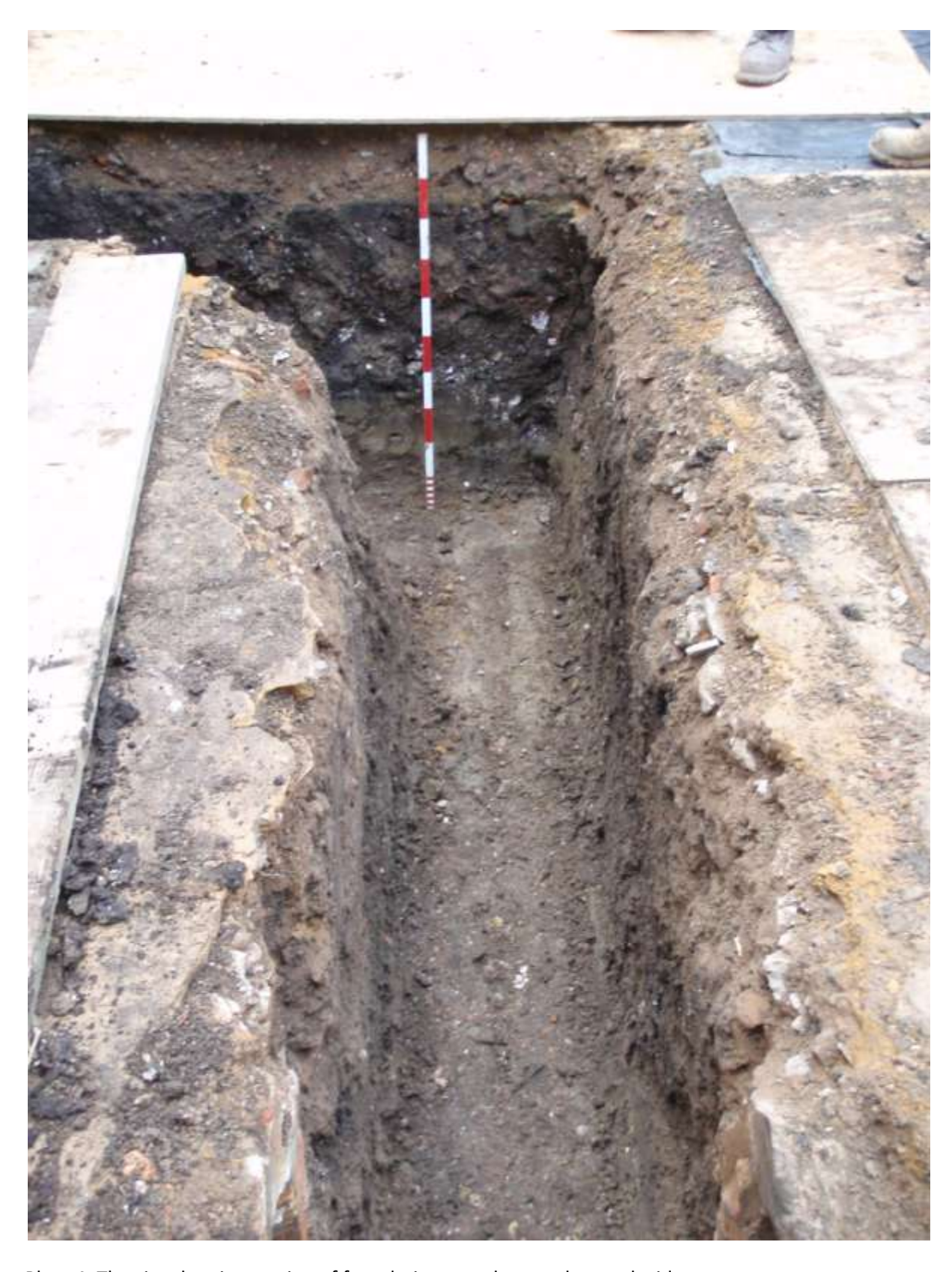
Plate 4. The site showing cutting of foundation trenches on the north side