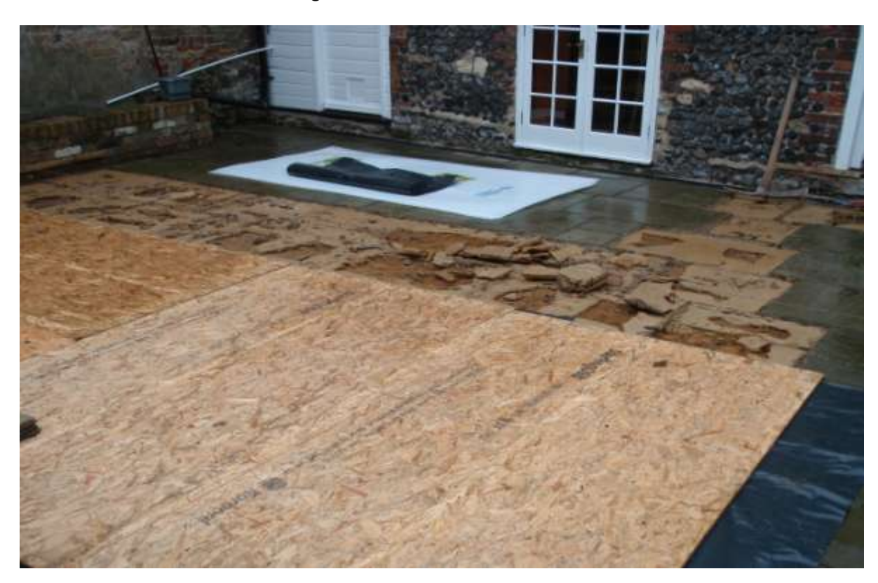
Plate 3. General view of site looking south