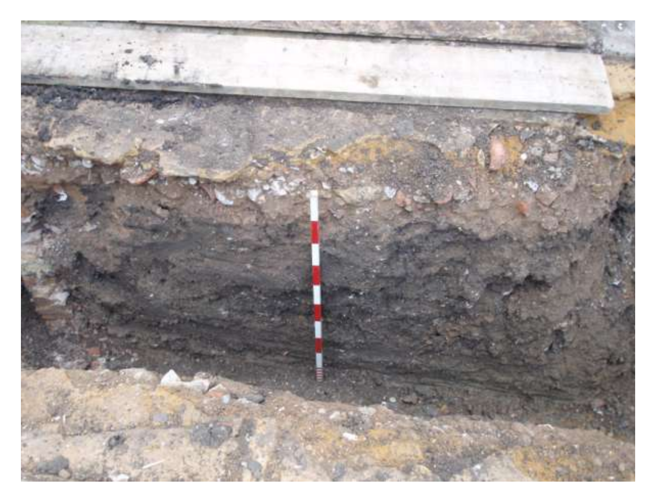
Plate 6. View of side of foundation trench