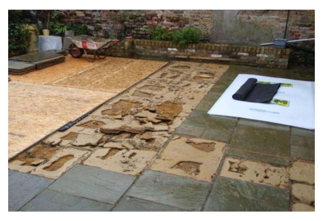
Plate 2. General view of site looking south-west