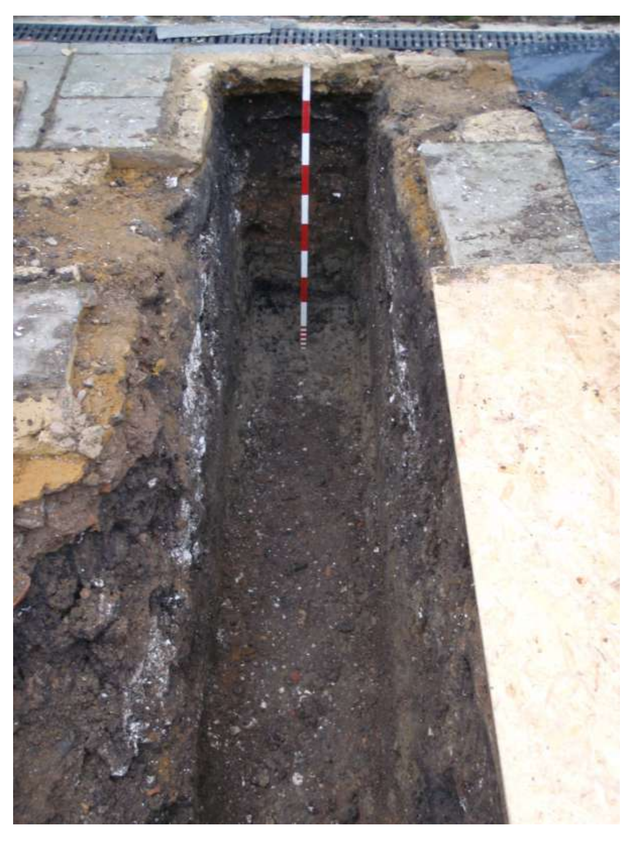
Plate 5. Foundation trenches on the south side